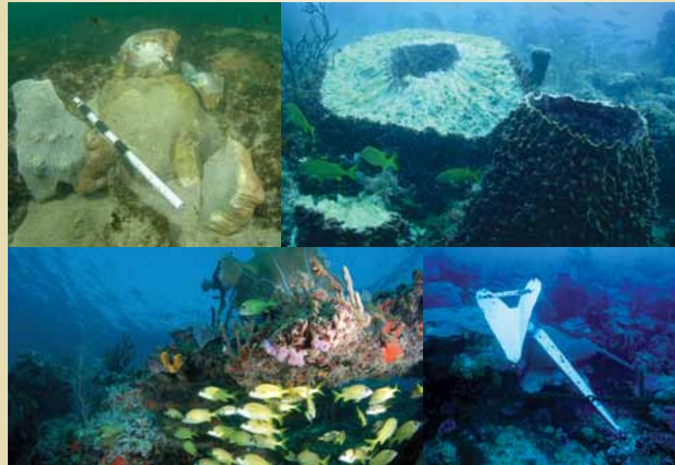
Vessel grounding and anchoring impacts (clockwise from top left): broken knobby brain coral ( Diploria clivosa ), severed giant barrel sponge ( Xestospongia muta ), an abandoned anchor on the reef, and a healthy southeast Florida coral reef.

AND HTTP://WWW.DEP.STATE.FL.US/COASTAL/PROGRAMS/CORAL/RIPR.HTM