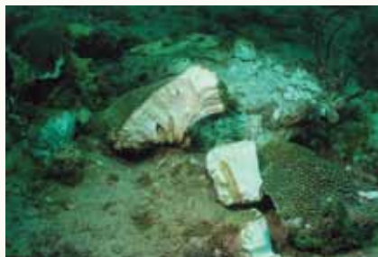
Shattered great star coral (Montastraea cavernosa), resulting from a vessel impact.