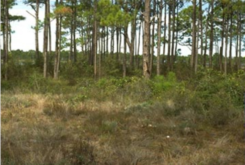
Looking across the interdunal swale wetland boundary into pine flatwoods