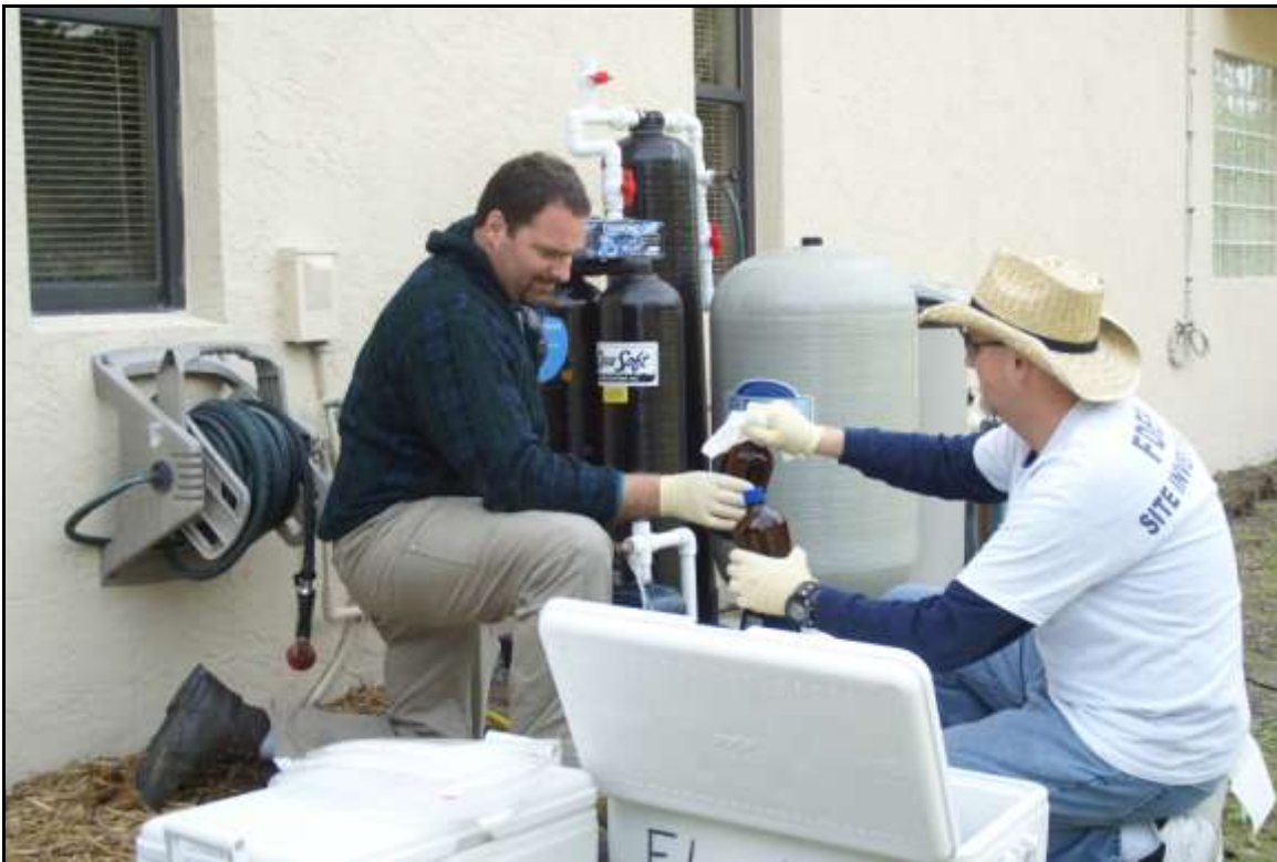
Photo # 2: SIS staff collecting water sample from pre-treatment side of a residential water treatment system

A complete list of chemical compounds and elements analyzed for by the laboratories is provided in Appendix A. Concentrations are reported in micrograms per liter (ug/L), milligrams per liter (mg/L) or, for radionuclides, picoCuries per Liter (pCi/L).