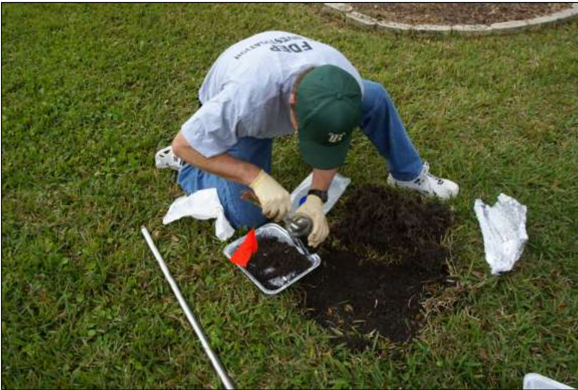
Photo # 1: SIS staff collecting shallow soil sample from residence

SIS Report Number 2010-04 Issued August 2010