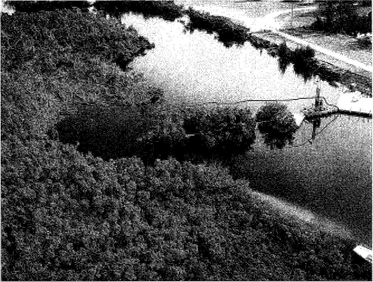
Figure 1 - Photo of Existing Boat Lift Structure. The area of the Structure outlined is to be removed.

RECEIVED - D.E.P. FEB 29 2008 SOUTH DISTRICT