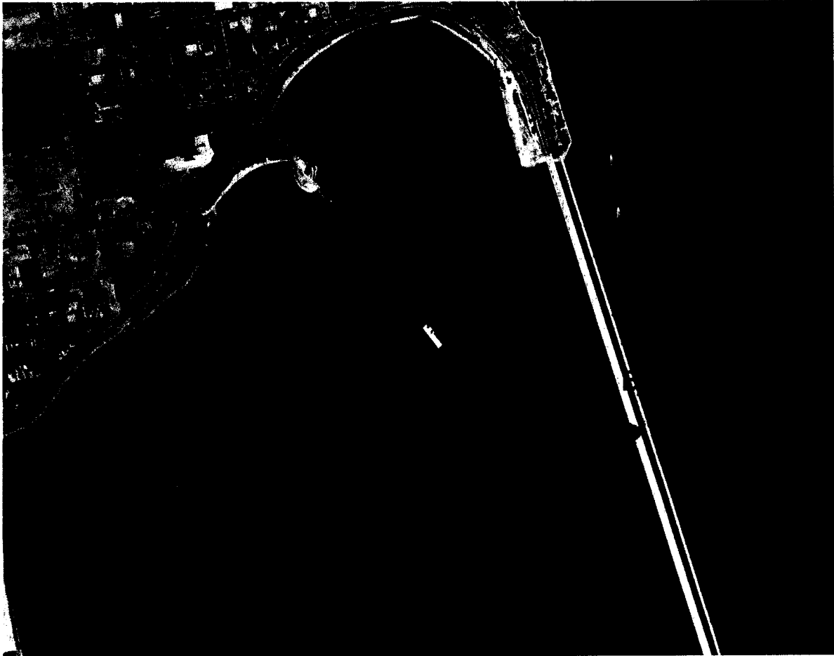
Figure 3. Aerial view of Phase I (preconstruction) and Phase II

sand shelf extends about 600 ft southward on the eastern end, and over 2000 ft bayward on the western end. The sand shelf, or flat, has a mild slope from the shore to about the - 6 ft MLLW contour, then drops more steeply to about - 12 ft MLLW on its southern and western sides. The deeper water on the western side serves as the entrance channel for the marina. Two tongues of deeper water extending into the sand flat on the western end were probably dredged at the same time as the entrance channel. About 3000 ft offshore there is a second drop off to the 20 + ft depths typical around the port and mid-bay.