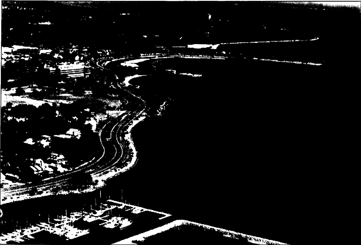
Figure 2. Phase I and Phase II site