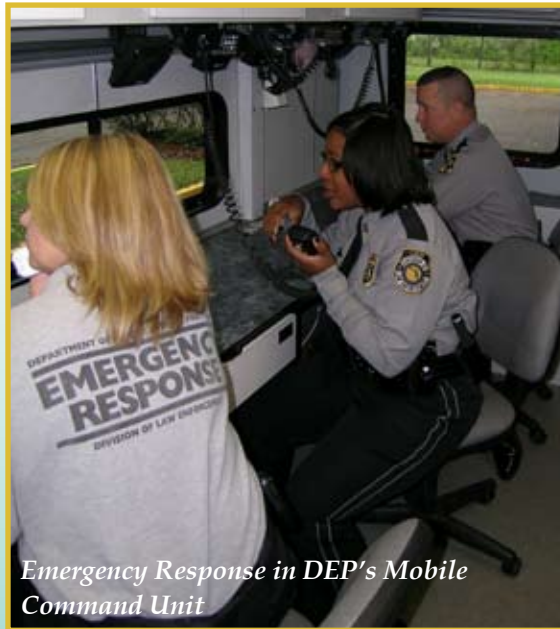
Emergency Response in DEP's Mobile Command Unit

The Bureau of Emergency Response (BER) responds to environmental pollution threats in every form. Responding to incidents ranging from petroleum spills caused by vehicle accidents to chemical plant explosions to coastal oil spills, BER provides technical and on-site assistance to ensure threats to the environment and human safety are quickly and effectively contained and abated.