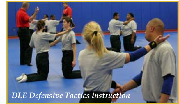
DLE Defensive Tactics instruction

The Training Center provides more than 50 training courses each year and more than 300 online courses.