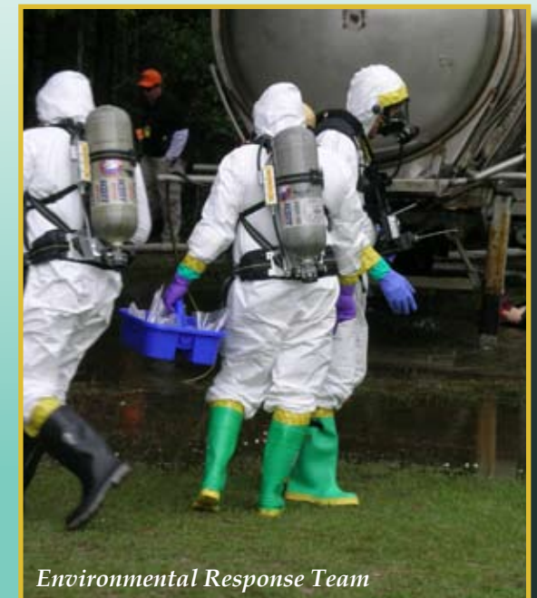
Environmental Response Team

The Environmental Response Team (ERT) is a multi-agency team that augments local and regional response capabilities to suspected criminal activity including potential terrorist events.