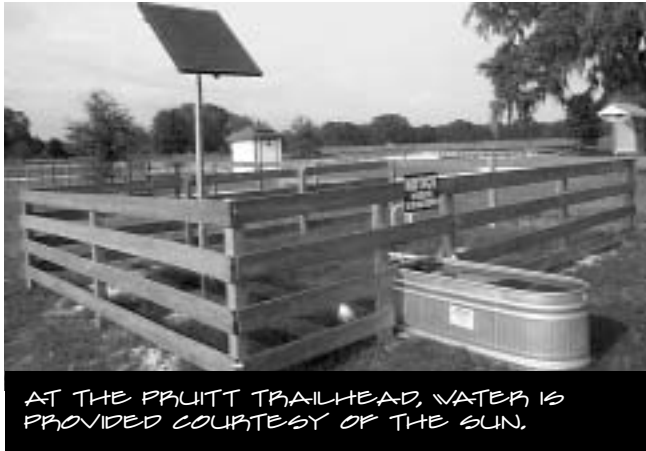
AT THE PRUITT TRAILHEAD, WATER IS PROVIDED COURTESY OF THE SUN.

MODERN technology harnesses an ancient energy source to provide water at the Pruitt Trailhead on the Marjorie Harris Carr Cross Florida Greenway.