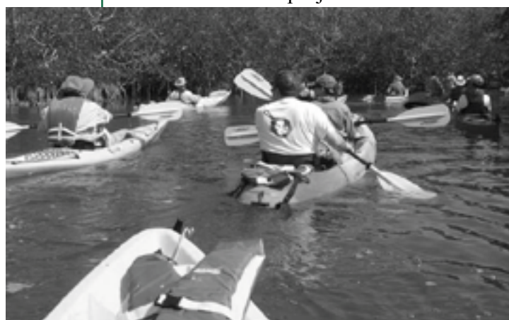
After the ribbon cutting ceremony, attendees enjoyed a paddling excursion.

The Florida Circumnavigation Saltwater Paddling Trail crosses 37 aquatic preserves and provides access to nearly all of Florida's coastal state parks, recreation areas and historic sites. The National Park Service, U.S. Fish and Wildlife Service, businesses, private citizens, local leaders and community organizations have contributed to the project.