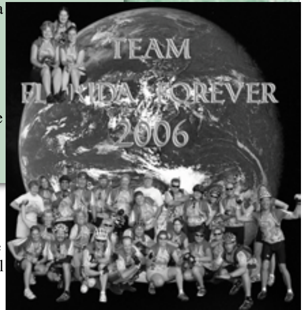
Team Florida Forever 2006