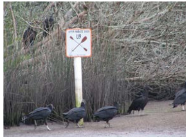
Paddle Manatee sign, FWC