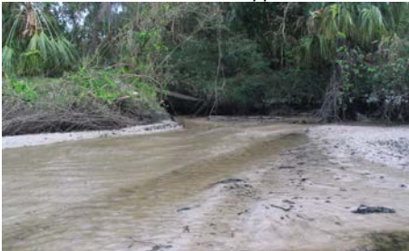
Rye Branch, FWC