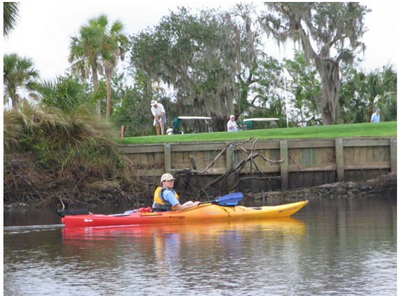
Putting and Paddling, FWC