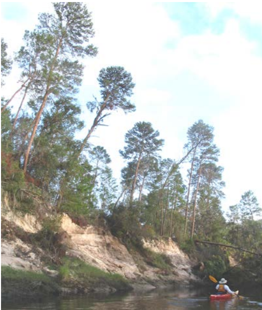
Upper Manatee, FWC

Rye Preserve is a 145 acre property located just northwest of the Lake Manatee Dam. The preserve features nature trails, horseback trails, picnic areas, a playground and a canoe/kayak launch. The preserve's trail system leads visitors through four distinctive ecosystems, including sand pine scrub, xeric oak scrub, oak hammocks and the river community. A variety of interesting creatures can be seen in these areas including the rare gopher tortoise and Florida scrub-jay. Rye Preserve is home to a piece of Manatee County's early pioneer history. Within the preserve visitors can view the Rye Family Cemetery, the last remaining reminder of the old Rye river community. Camping is available at the Rye Preserve on a first-come-first-serve basis by checking in at the Ranger Station from 3:00 p.m. until 7:00 p.m.