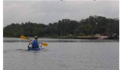
Approaching Ft Hamer boat ramp, FWC