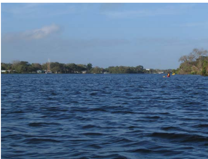
Caloosahatchee River