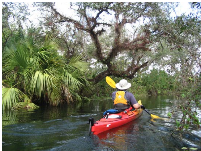
Upper Hickey Creek

This paddling trail was likely used for travel and subsistence by the Calusa people, who lived along the coast of southwest Florida until they were finally eradicated in the late 1700s. Living and surviving on the coast caused the tribesmen to become great sailors. They defended their land against other smaller tribes and European explorers that were traveling by water. The Caloosahatchee River, which means "River of the Calusa," was their main waterway. They traveled by dugout canoes, which were made from hollowed-out cypress logs. They used these canoes to travel as far as Cuba. Explorers reported that the Calusa attacked their ships that were anchored close to shore. The Calusa were also known to sail up and down the west coast salvaging the wealth from shipwrecks. The Calusa lived on the coast and along the inner waterways. They built their homes on stilts and wove palmetto leaves to fashion roofs, but they normally didn't construct walls. The Calusa Indians did not farm like the other Indian tribes in Florida. Instead, they fished for food on the coast, bays, rivers, and waterways. The men and boys of the tribe made nets from palm tree webbing to catch mullet, pinfish, pigfish, and catfish.