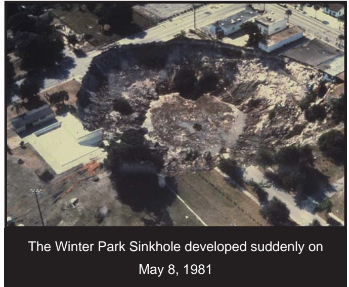
The Winter Park Sinkhole developed suddenly on May 8, 1981

This list demonstrates the interaction we as a human species have with the dynamic earth. We are subject to all its hazards and forces, and we must be knowledgeable and informed to best prepare and plan our societal response.