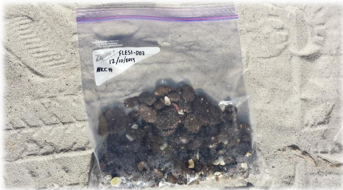
SRBs mitigated from FLES2-003