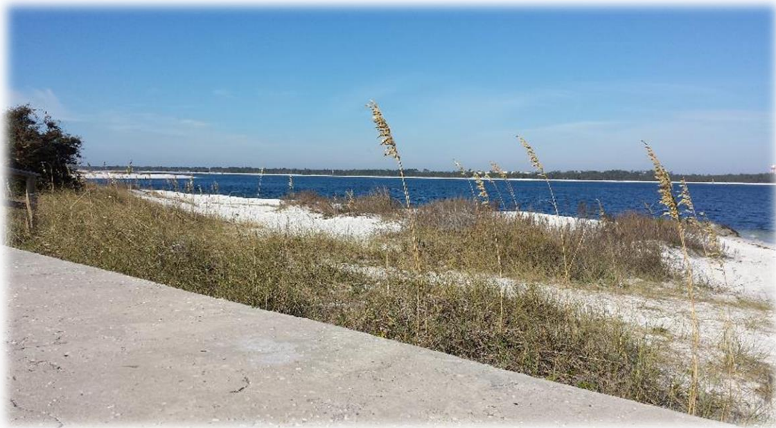
Conditions at NPS Ft. Pickens

During today's survey the skies were partly cloudy, winds were NE @ 10 knots, and the seas in the Gulf were one foot or less. The tide was low and rising, with low tide (-0.29 ft.) at 10:51 AM this morning and high tide (1.12 ft.) at 12:14 AM last night.