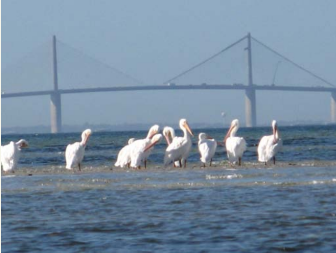
White Pelicans are seasonal visitors to Tampa Bay.