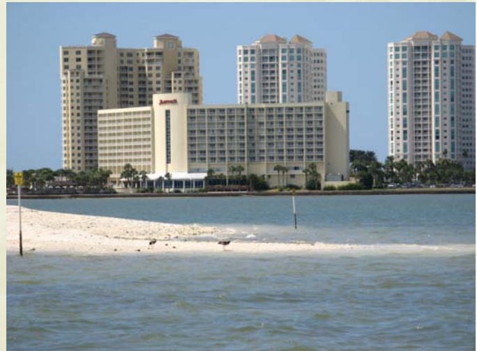
An American Oystercatcher pair, a threatened species, raises its young on an island in Pinellas County, Florida's most densely populated county.

As Tampa Bay's aquatic preserves manager, I have had scarcely more than a decade to learn the lessons from these four decades of issues