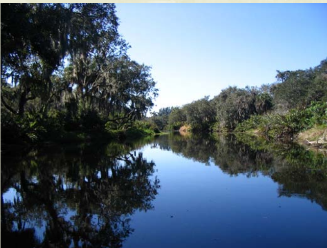
Vegetated shoreline of Frog Creek in Terra Ceia Aquatic Preserve.