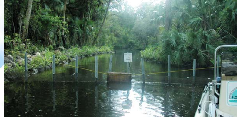
This fike net, used to monitor fishes and invertebrates, is placed at an oxbow reconnection site along the upper reaches of the North Fork.