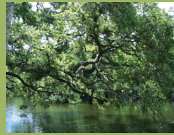
Oaks along the North Fork provide shade for recreational fishermen and environmental artists