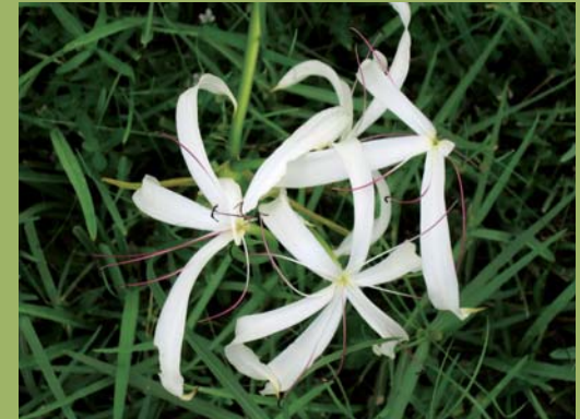
Swamp lilies provide shelter for fish and protect shorelines from excess wave energy.