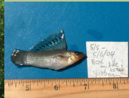
Sailfin mollies have been documented to use the new berm breaches as a breeding ground.

Significant portions of the North Fork St. Lucie River were dredged in the early 1900s to support navigation and provide effective flood relief. Spoil from the dredging project was deposited along the banks of the newly created channel. These deposits resulted