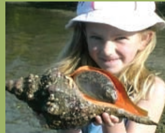
Young naturalist holding a horse conch