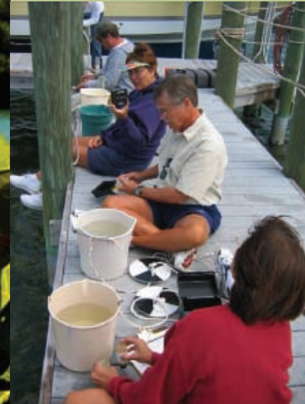
Training for water quality monitoring volunteers

In 1996, the Charlotte Harbor Estuaries Volunteer Water Quality Monitoring Network was developed. At sunrise on the first Monday