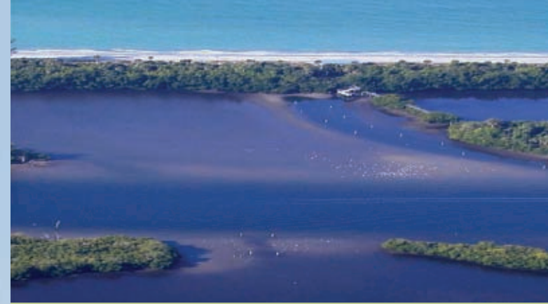
Aerial view of Lemon Bay