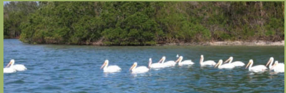
White pelicans in residence for the winter