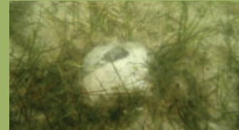
A "sand collar" of eggs produced by a moon snail will yield a new generation of marine life