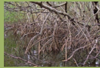
Mangrove forests, oyster reefs and seagrass beds support abundant wildlife

Randy Runnels Aquatic Preserve Manager 130 Terra Ceia Road Terra Ceia, FL 34250 (941) 721-2068 www.aquaticpreserves.org