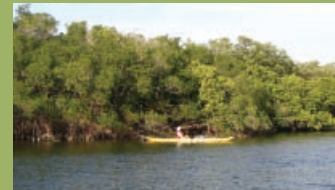
Kayaks are a popular means of navigating shallow waters in search of big gamefish