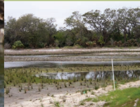
Recently-planted marsh grasses take hold in a wetland restoration site

Over the past century, much of the land adjacent to the Cockroach Bay Aquatic Preserve was either farmed or quarried for shell. In recent years, the Southwest Florida Water Management District has led a variety of agencies, organizations and individuals in the