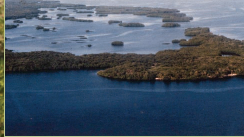
Aerial view of Cockroach Bay