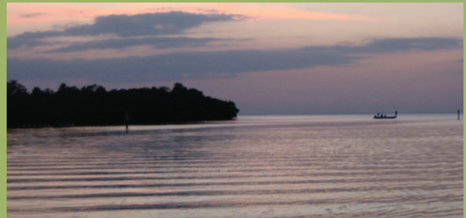
Sunset doesn't end the enjoyment of this exceptional area