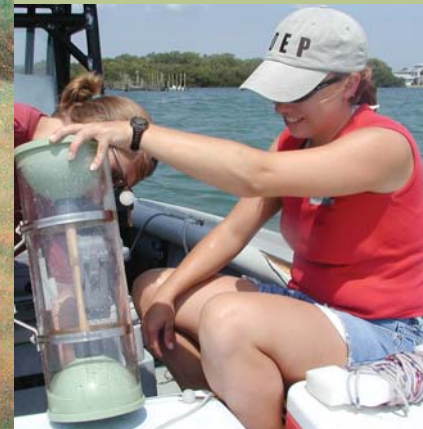
Water quality testing in Charlotte Harbor

Long term health of the Charlotte Harbor Aquatic Preserves depends on maintaining good water quality to support diverse