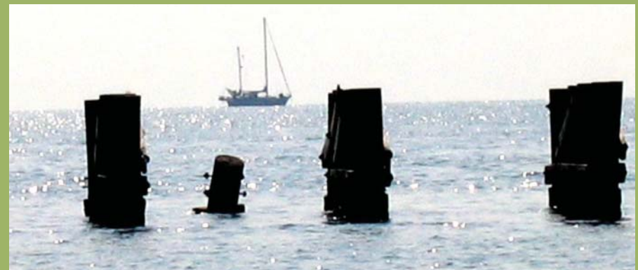
Remaining pilings of an historic phosphate loading dock at Boca Grande Pass support an impressive underwater assemblage of marine organisms