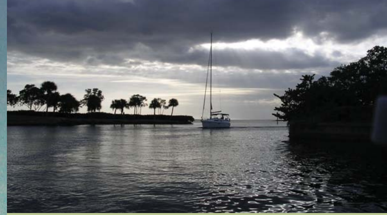
Returning home from a day of sailing in Charlotte Harbor