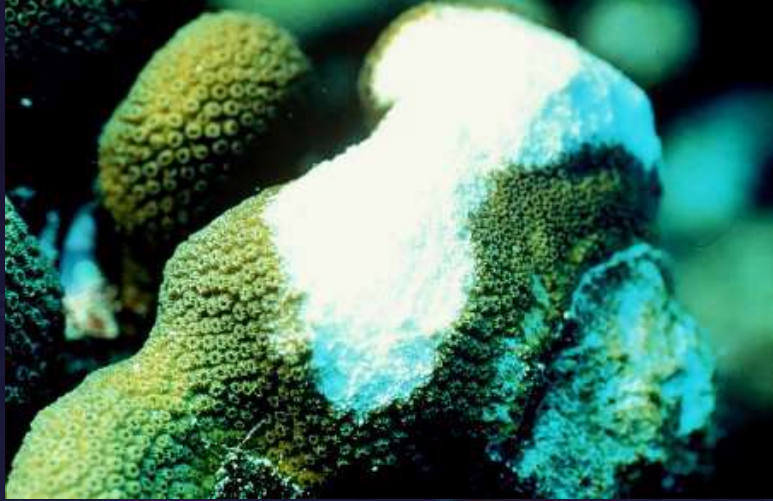
Rapid wasting - the attack of the rabid parrot fish