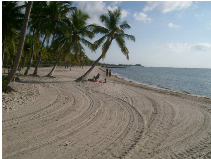
Smathers Beach in Florida Keys, FDEP photo 2007.

2600 Blair Stone Rd., MS 3590 Tallahassee, FL 32399-3000 www.dep.state.fl.us