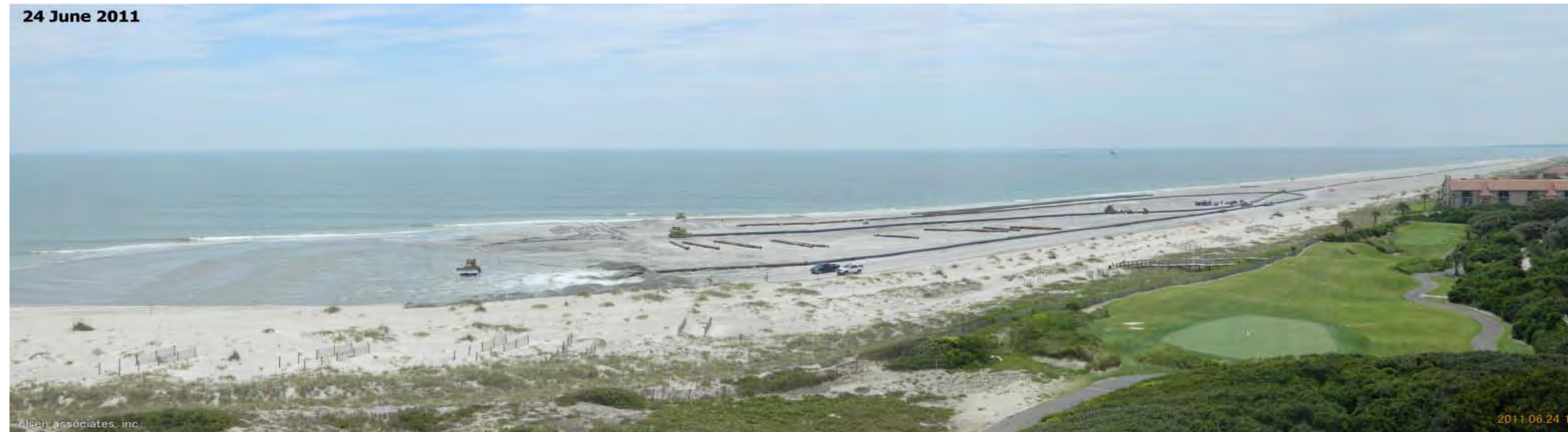
Beach Nourishment of the South Amelia Island Shore Stabilization Project during construction in June 2011

The Beach and Shore Preservation Act and the Ecosystem Management and Restoration Trust Fund [Sections 161.091, and 201.15, Florida Statutes] charge the Department with developing and implementing a comprehensive, long-range statewide beach management plan. In fulfilling that responsibility, the Department has developed, in coordination with local sponsors and the United States Army Corps of Engineers (USACE), a Strategic Beach Management Plan (Strategic Plan), a Long Range Budget Plan (Budget Plan), and a prioritized list of specific beach erosion control projects for FY 2012/2013 (Local Government Funding Request).