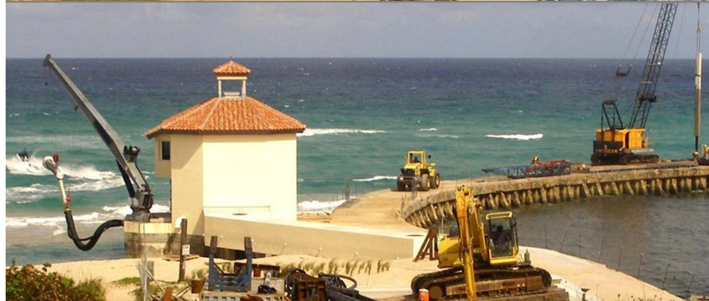
South Lake Worth Inlet Sand Transfer Plant Renovation: Before (top photo) and after (bottom photo) reconstruction in 2010

The Beach and Shore Preservation Act and the Ecosystem Management and Restoration Trust Fund [Sections 161.091, and 201.15, Florida Statutes] charge the Department with developing and implementing a comprehensive, long-range statewide beach management plan. In fulfilling that responsibility, the Department has developed, in coordination with local sponsors and the United States Army Corps of Engineers (USACE), a Strategic Beach Management Plan (Strategic Plan), a Long Range Budget Plan (Budget Plan), and a prioritized list of specific beach erosion control projects for FY 2011/2012 (Local Government Funding Request).