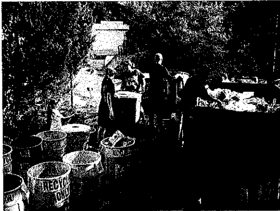
Volunteers in Action collecting over 2200lbs