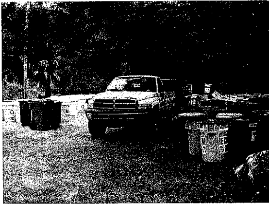
Truck Trailer and Containers at the home site