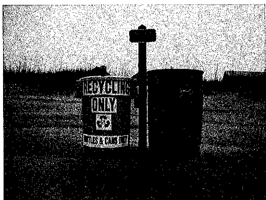
Recycling Set up used on Beaches