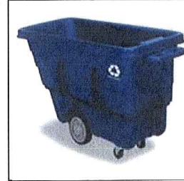
6 CY 750 lb Limit Tilt Cart