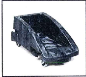
Slim Jim Trolley