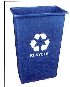
Recycling Slim Jim 23 Gallon