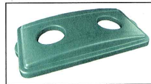
Slim Jim Lids Green with Holes