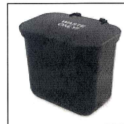
Hanging Baskets Black