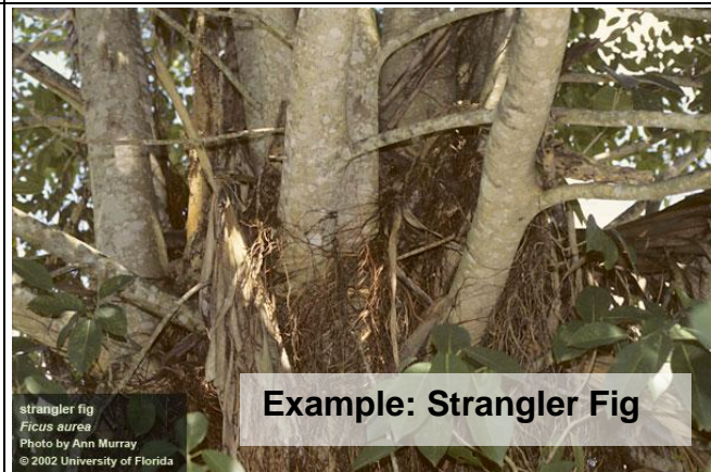
Example: Strangler Fig

Vascular, Seed-bearing, Flowering, and Fruit bearing, Monocot: Flower parts in multiples of three; leaves usually narrow and long; parallel veins; seeds have one cotyledon