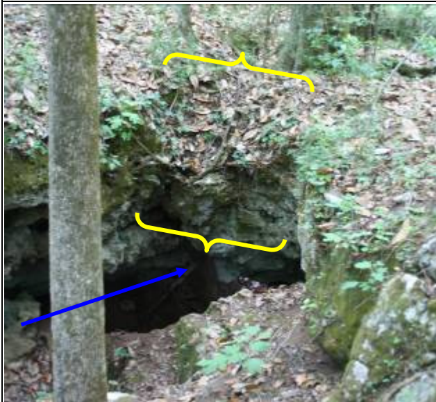
Natural Bridge: A rock bridge spanning a conduit and not yet eroded away.