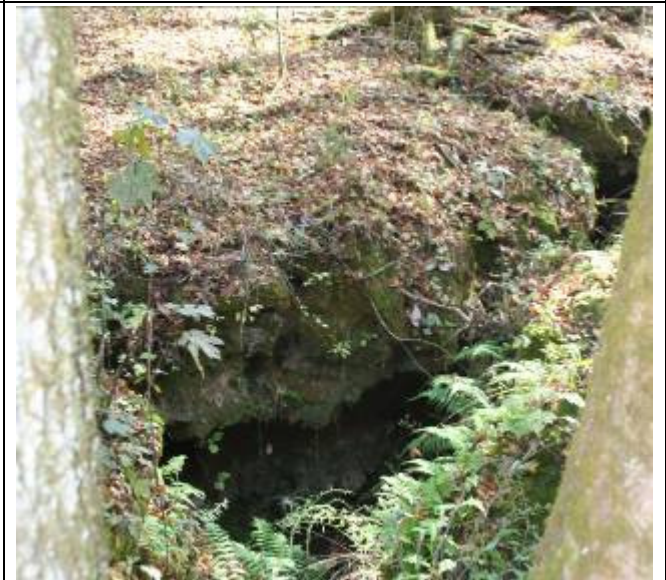
Ravine: relatively large dissolutional voids, including enlarged fissures and tubular tunnels; they have very steep sides and are typically very long and fairly narrow.