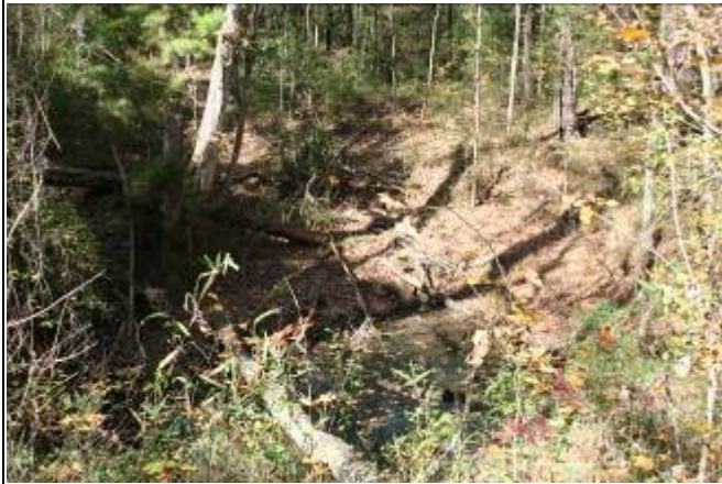
Sinkhole: a depression in the ground that can have gently or steeply sloping sides; water may be present in the bottom.