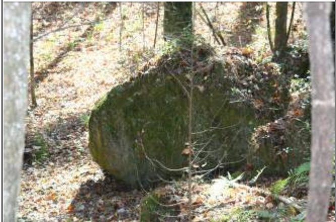
Outcrop: a visible extension of bedrock limestone jutting out from the surface either vertically or horizontally.