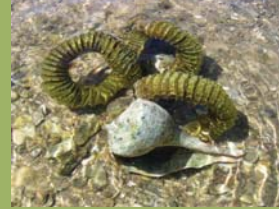
Lightning whelk and egg casings