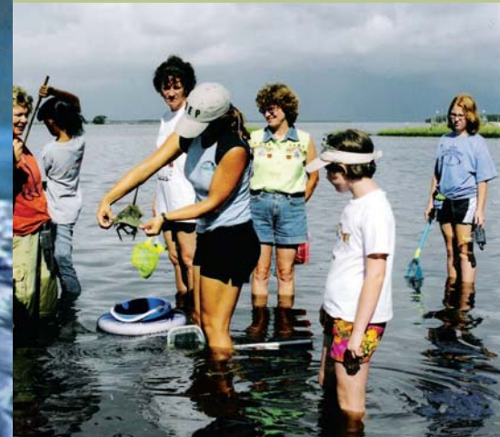
Waders find a horseshoe crab in the sound

Each year, 4 wading trips are offered to the general public to "muck about", exploring the near shore treasures of the Aquatic Preserve.