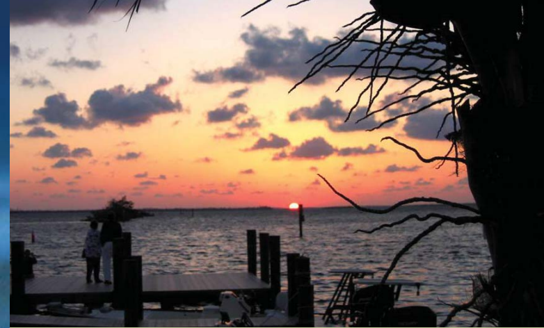
Typical sunset across the sound