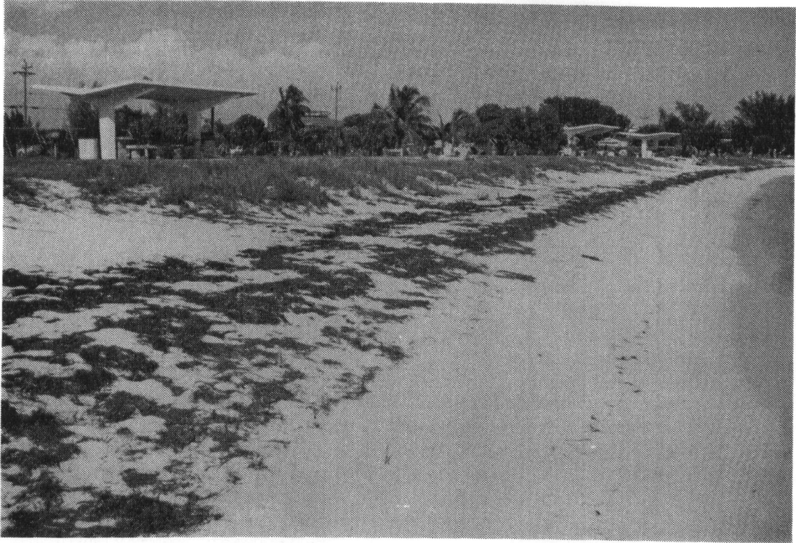
Figure 10. Sombrero Beach, Vaca Key