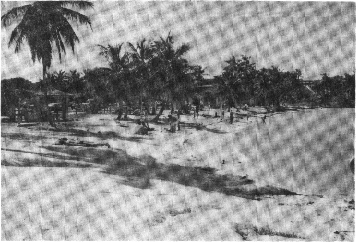
Figure 12. Bahia Honda State Recreation Area